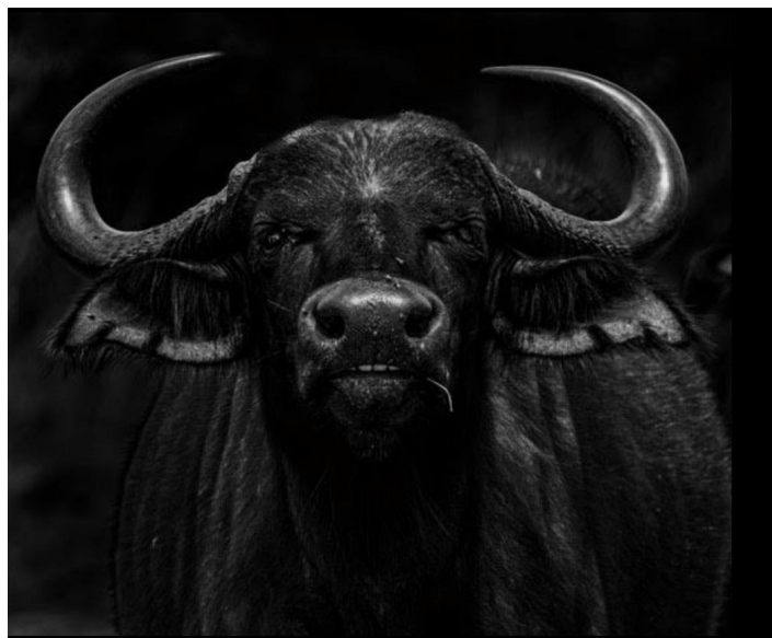
Bruce Clark Buffalo Toothpick 33