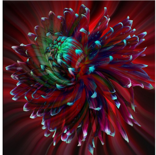
4 Star – Lesly Kearns Psychodahlia 43 COM