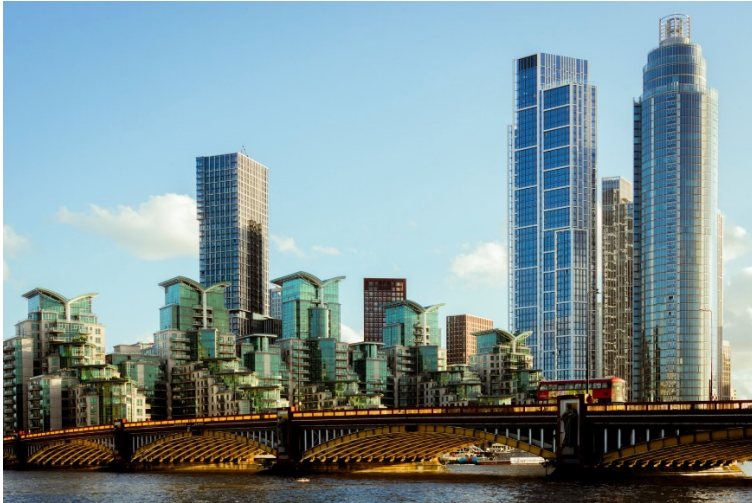
1-3 Star Danae Cole Urban Giants 40

5 Star - David Wolstencroft (Street Abduction 45 COM)