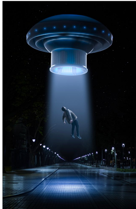
5 Star David Wolstencroft Street Abduction 45 COM