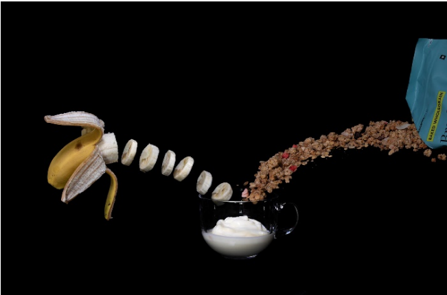
Bruce Clark Breakfast is Served - 35