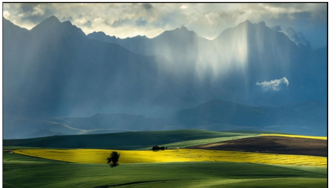
Dudley Schnetler Passing Shower 38 COM