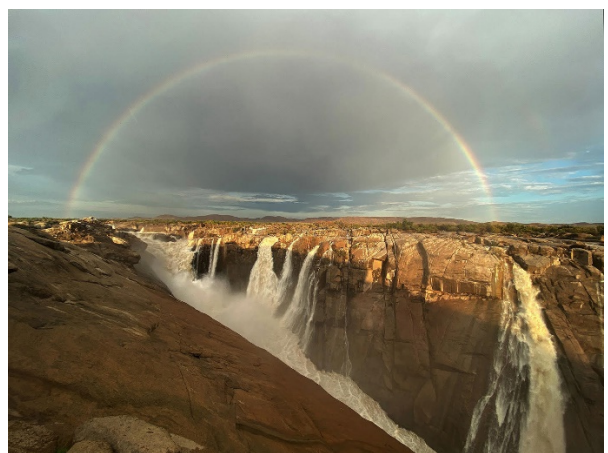
Rainbow over Augrabies Falls 36